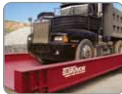
SURVIVOR ® SR Extreme-duty, low profile concrete or steel deck siderail scales