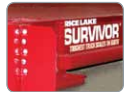
SURVIVOR ® ATV Heavy- and super-duty top access portables