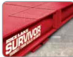
SURVIVOR ® OTR Top access, low profile concrete or steel deck scales