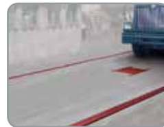
SURVIVOR ® PT Pit-type concrete or steel deck scales